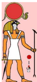
Ra The Egyptian Sun god.

Plague #9 - Three Days of Complete Darkness against the Egyptian god, Ra.