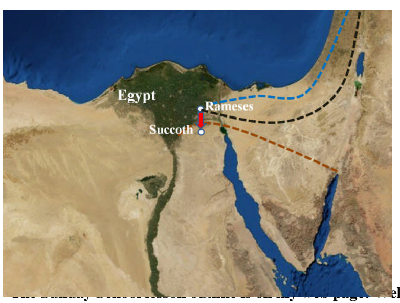
A. The children of Israel traveled from Rameses to Succoth. Vs. 37

Three trade routes from Egypt going east.