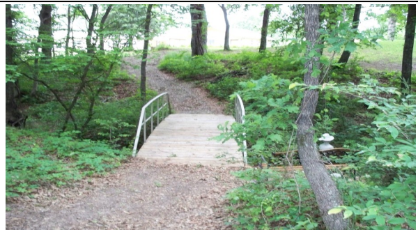
Stroll down the "Trail of Prayers"

Other outdoor activities include hiking, outdoor games, nearby fishing, and picnics in the beautiful pecan grove.